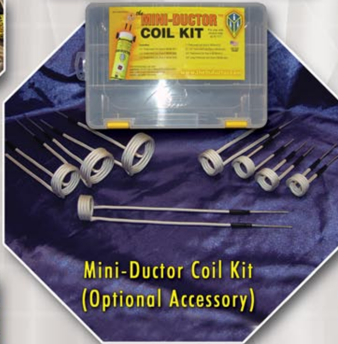
Mini-Ductor Coil Kit (Optional Accessory)