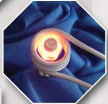
All Types of Seized Hardware (over heated to illustrate power)