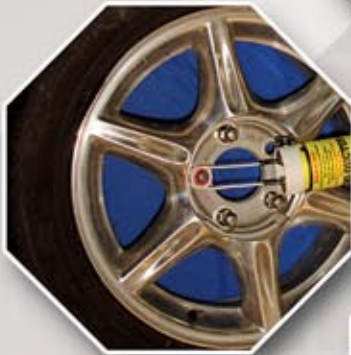
Prevent Expensive Wheel Damage