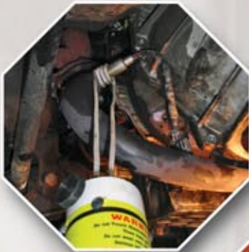
O 2 Sensors