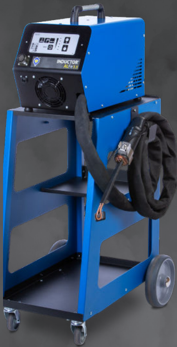
ALFe 3.5 (IC-3500) Cart optional