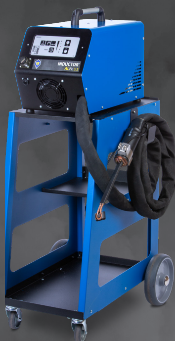
ALFe 3.5 (IC-3500) Cart optional