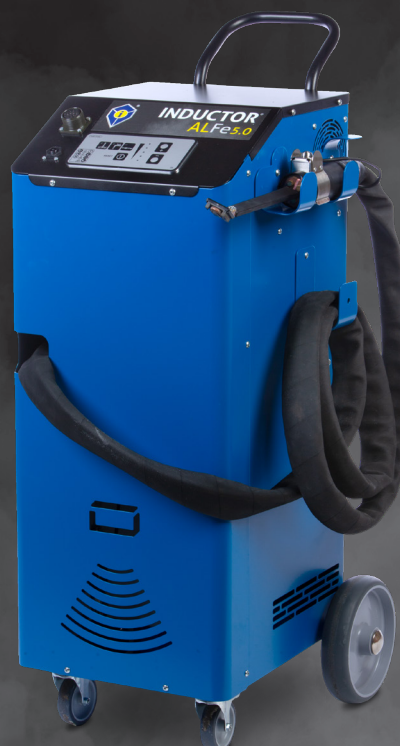
ALFe 5.0 (IC-5000)