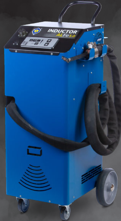
ALFe 5.0 (IC-5000)